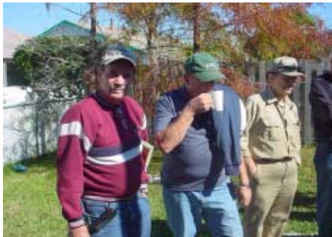
Supervisors are always required! (N4GM, W4BP, W3AZD)