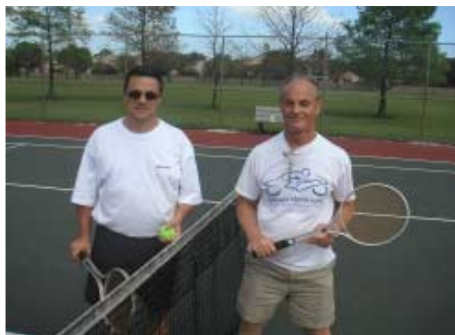
OK1DTP and N4BP taking a tennis break between the pileups!