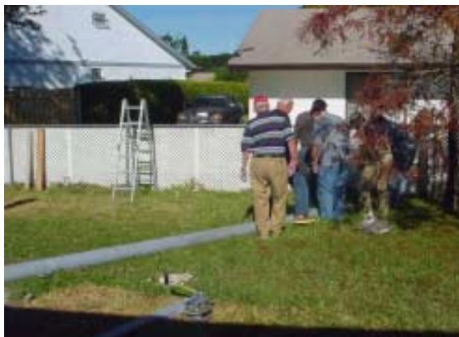
Planning the erection is a necessity!