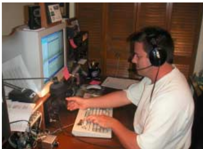
OK1DTP running Europe on 21 Mhz at N4BP M/S