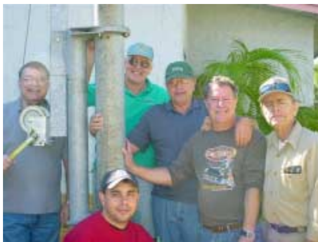
L to R standing: W1RG, N8PR, W4BP, AC4VU, W3AZD Squatting : W4DTA