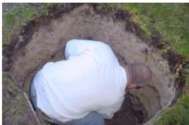
Shovel Some More!