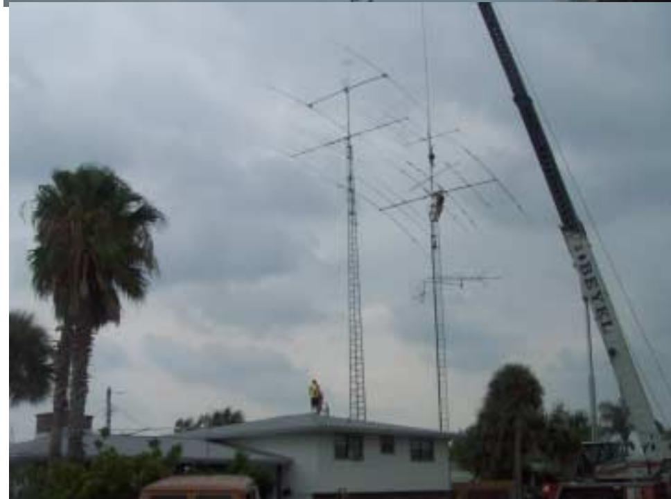
Top: Jeff and Tim on the Trylon 80 foot tower finalizing the Force-12 C31XR after putting up the XM240