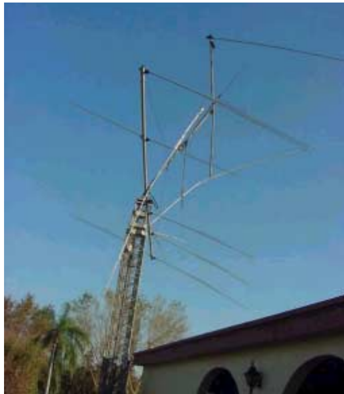
N8PR - Hollywood One Tower and Antennas