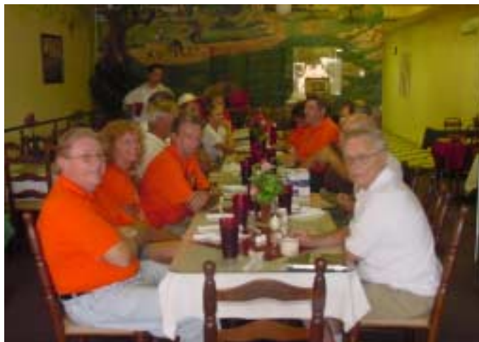
Enjoying lunch at Franco's - Left from Foreground - K5KG, KD4BRJ, N4EK, 2 people obscured, K1PT (with the hat) KD1BG. Right from foreground W4YA, 2 people obscured, K4DDR, NA4CW.