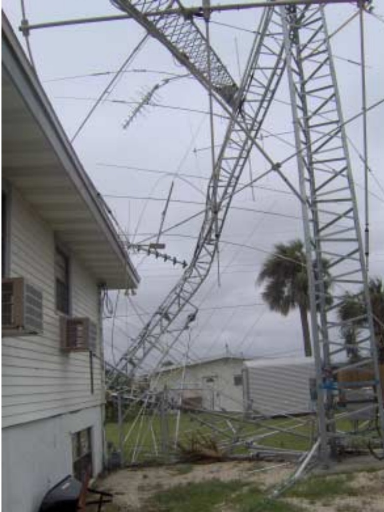
More Views of K9ES Post Wilma