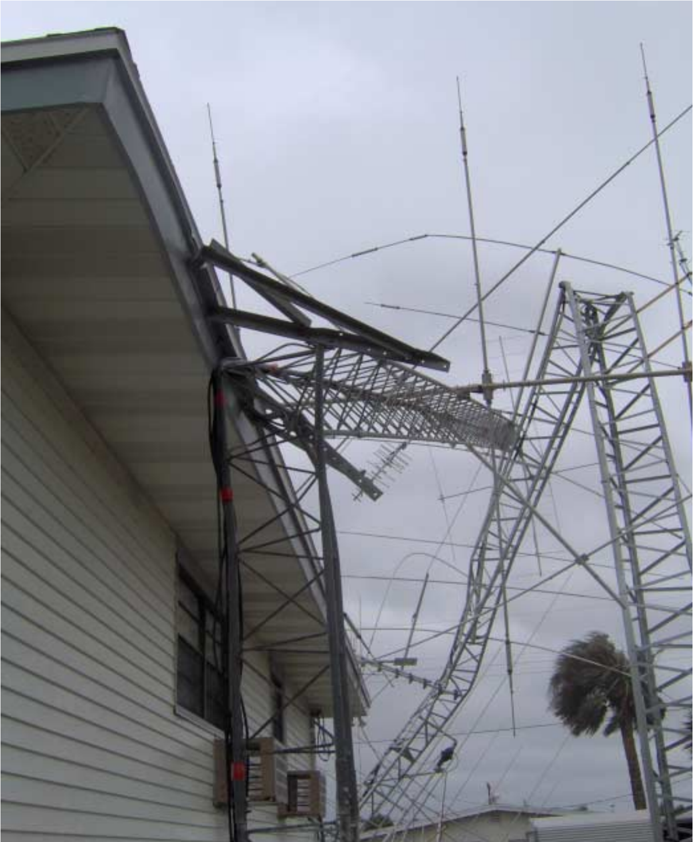
K9ES After Wilma