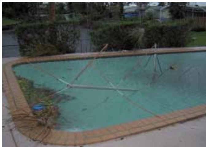
W4OV 6M Quad Takes a Swim