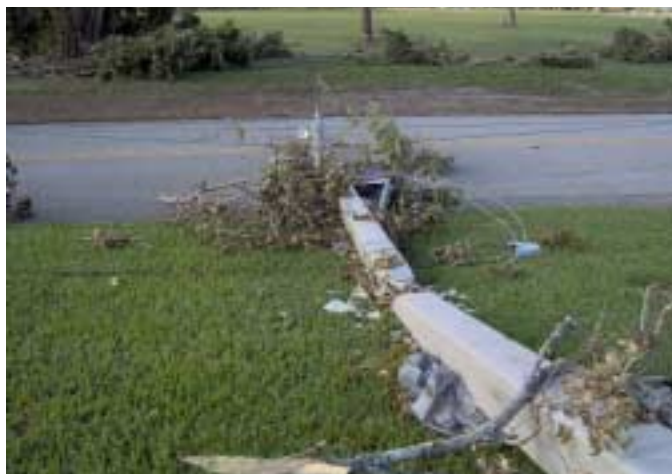
12X12 Concrete Power Pole near W4OV Up since 1967