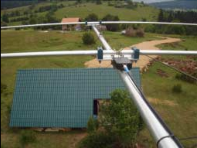
Finished beam on tower - several perspectives, above below and left