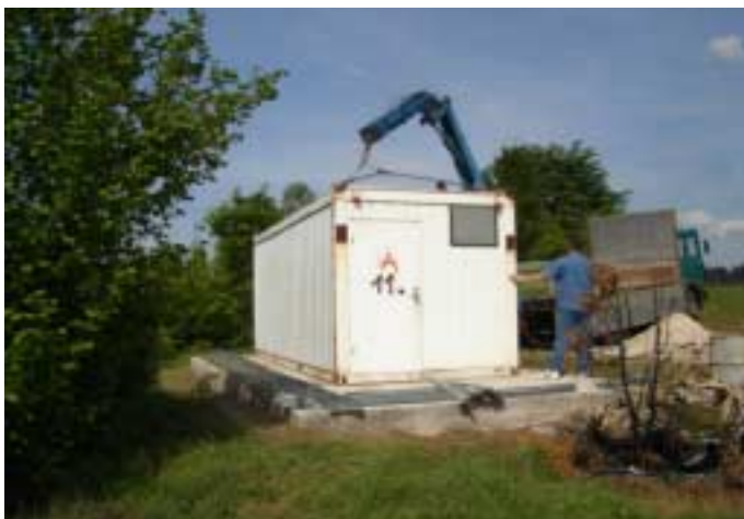
Touchdown of shack container