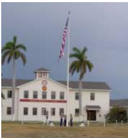
Below: Marines raise flag at HQ Building