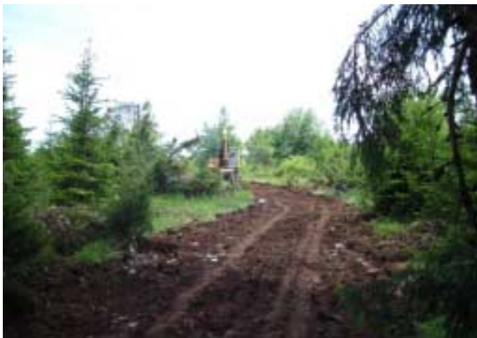
Road to contest location under construction