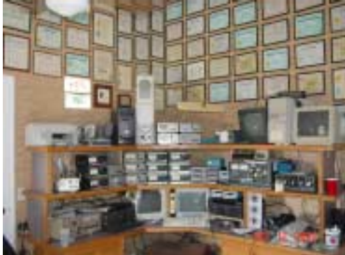
A portion of K4XS Main Operating Position