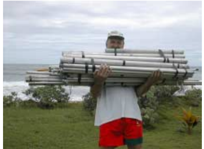
All the vertical antennas needed for the recent 6Y5A operation, in one neat bundle!