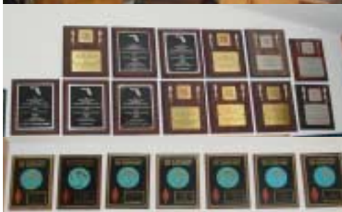
Part of the K4XS Plaque Collection