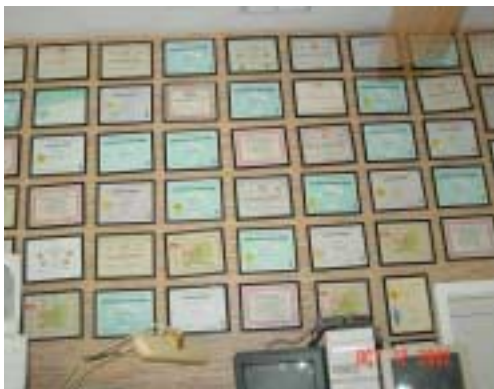
A (small) part of the K4XS certificate collection