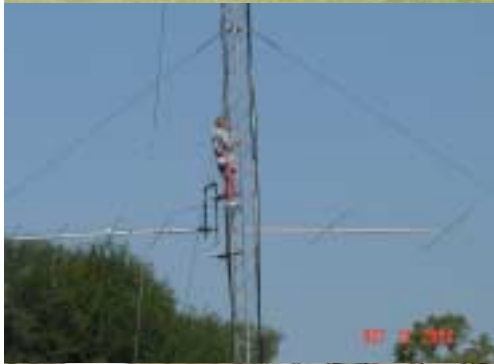
Part way up. (Bill was too small to picture when he reached the top!)