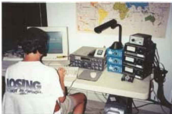
WC4E starts the contest on 20 Meters . Note Screw driver in the TS-930 to keep the radio on!