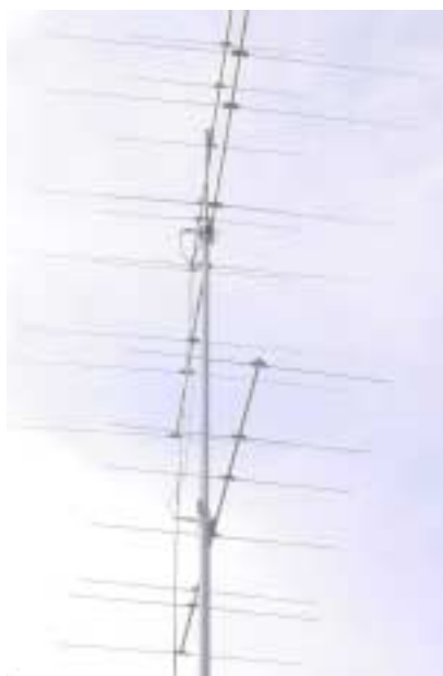
The 'Big' tower at W4UM above and the small tower to the left