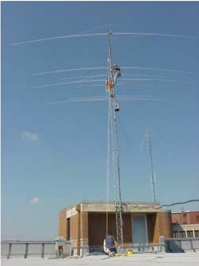
Jeff, WC4E (blue shirt) and Dan, K1TO (orange shirt) do some work on the Force 12 C4XL at the UCF Radio Club before the meeting.