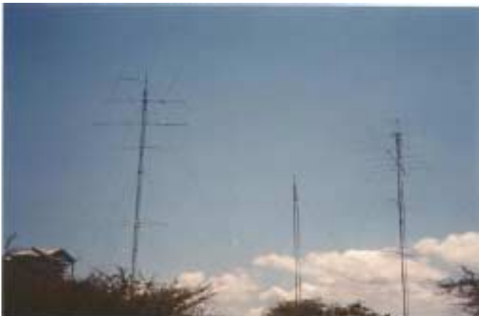
A good shot of the antennas of PJ2Z after a hard week of work. Left tower has 2el 40, 5el on 20, 15 and 10 Meters. A3 fixed to SE. The Right Tower has 5el 6M, Mosley CL33. 5 el 20 and 5/5 on 10M fixed to USA. The center tower will old a future 2el WARC antenna.