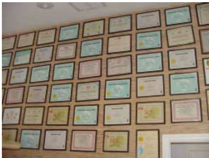
A small portion of the K4XS "certificate wall"

Additional pictures of some of the meeting attendees are shown on the next page