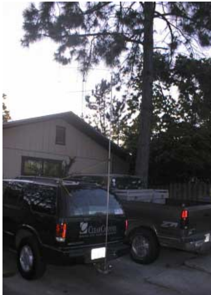
NF4A Mobile - Top Right: The 20/20 combo on the trailer hitch. Center Right: The 15 Meter Hamstick on the front bumper. Below: The operating position. The 706 was mounted on a special mount for police cars to hold their laptop...of course, there is the pack of Red Man, the official chewing tobacco of the FQP