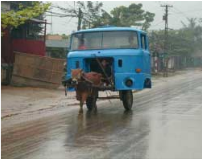
This mobile showed up again this year, working his 5th FQP. There is some suspicion he may be an undocumented alien, since no log was received.