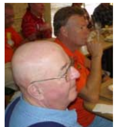
Background: Bill K4XS Foreground: Ink N400