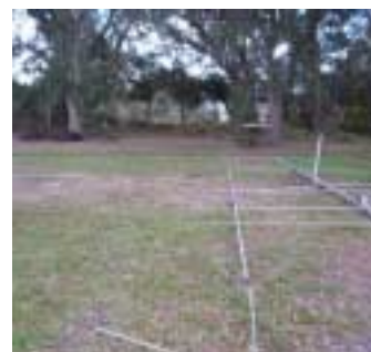
Broken beams finally down