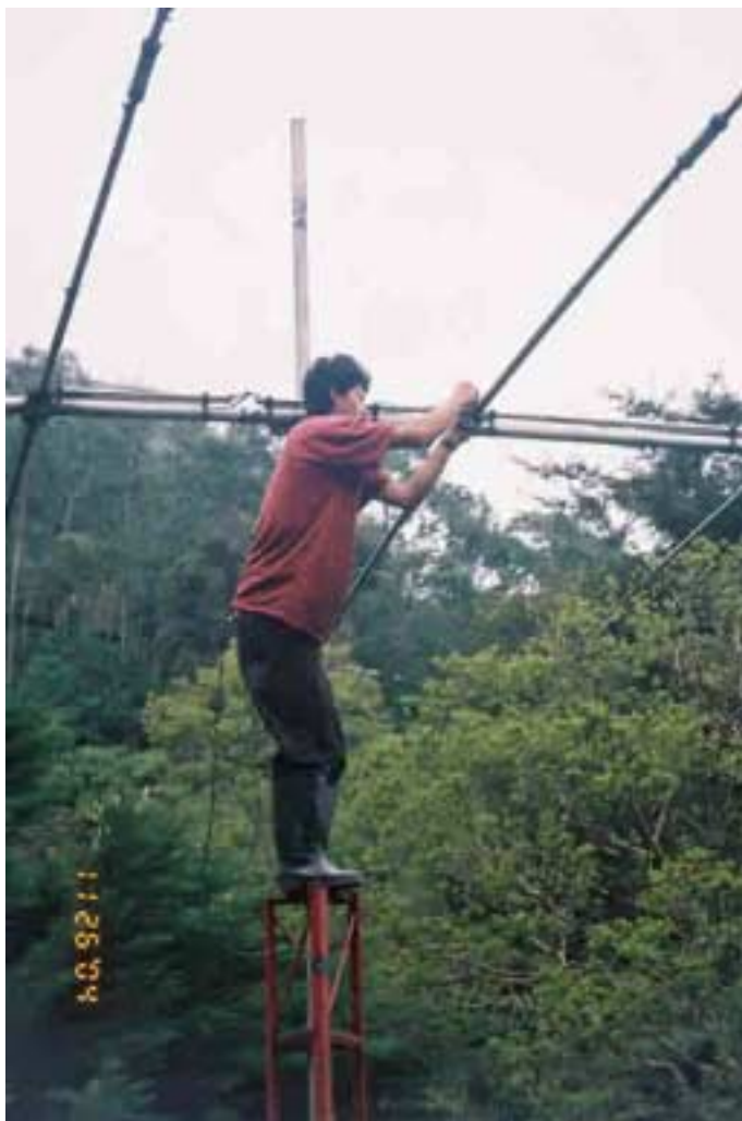
Final adjustments before the contest!