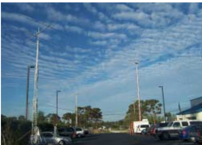
15 Meter, 10 Meter and VHF Antennas