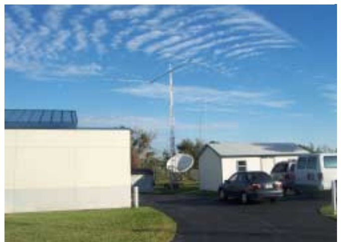
40 Meter Beam