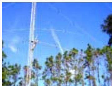
Removing 10 Meter beam with a broken boom.