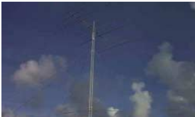
Force 12 C31XR at 60 Feet