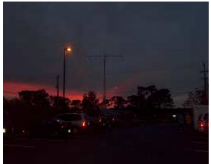
10 Meter Beam at Sunset