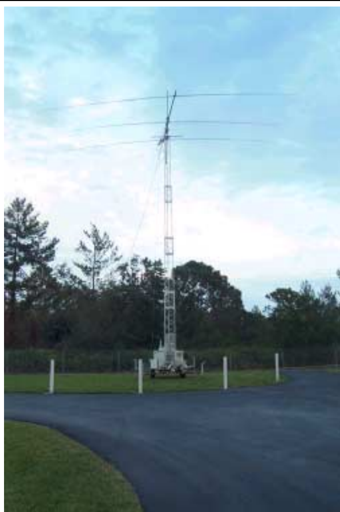
3 El 20M Yagi

The operation produced 3 times as many QSOs as ever made from WX4MLB during a Skywarn Recognition Day. We believe that the operation may have placed NWS Melbourne at the top of all NWS Stations. Hope some of you had a chance to work us. QSL via QRZ.COM info.