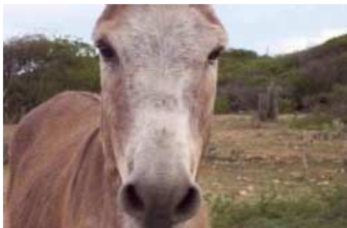
Closeup of another friendly fellow