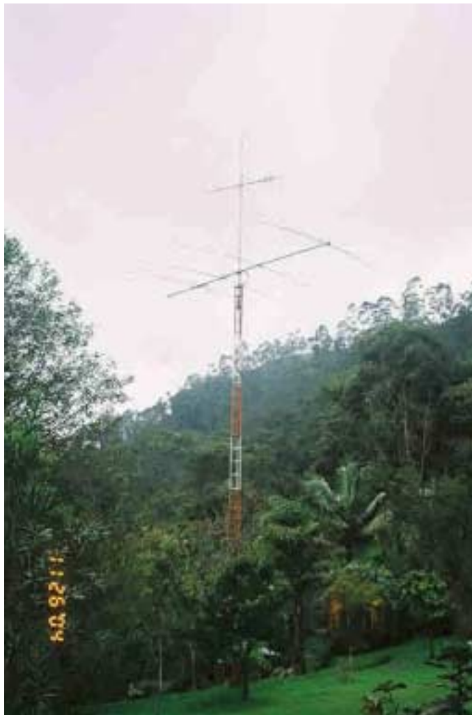
Completed Antenna Installation - 5K5Z