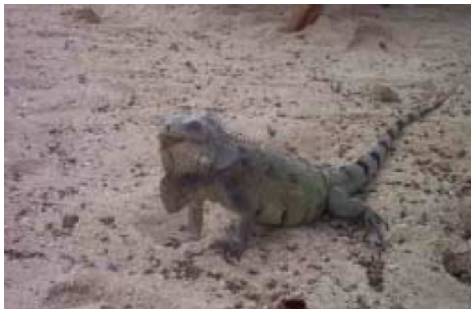
A very friendly creature