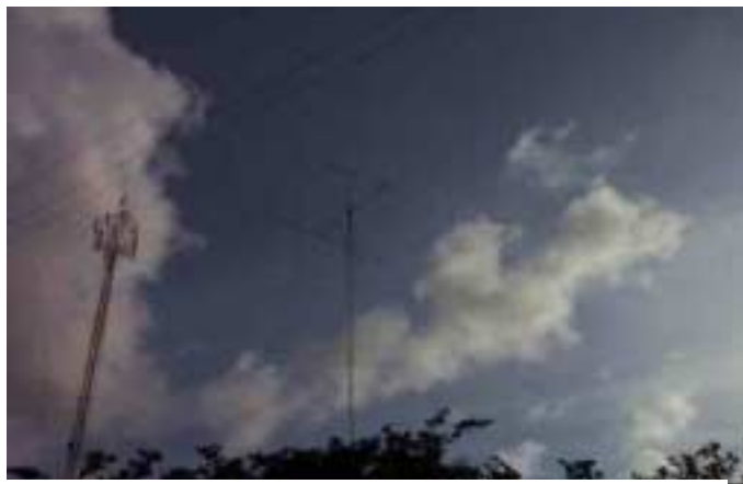
2 element 40 Meter beam at 90 Feet