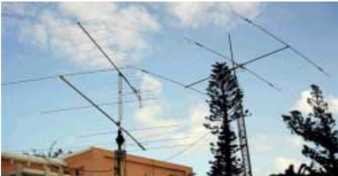
The Antenna Farm at VP9GE

Our station consisted of 2-ICOM 706s, 2 lap top computers running CT, A3 and A4 yagis, a G5RV and a dipole in MSLP 3840 X 408 111 4,767,015