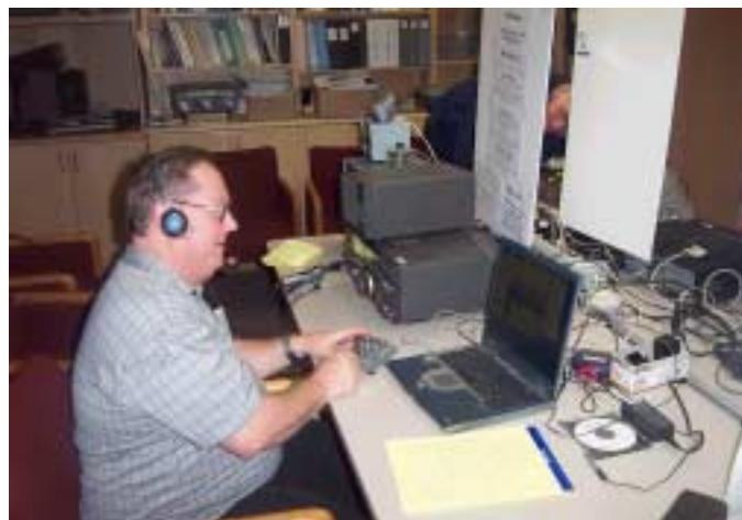
AD4ES on 40M SSB