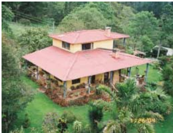
The 5K5Z QTH