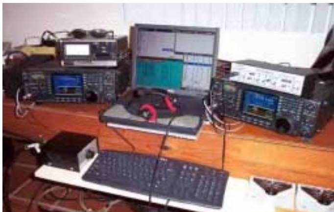
SO2R Setup at PJ4J