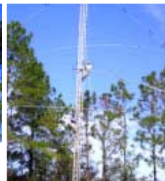
Removing broken 20M beams from tower