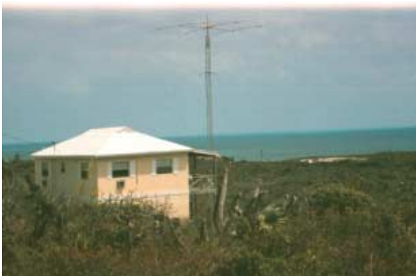
KX4WW's QTH on Providenciales, Turks & Caicos Islands, site of the VP55W operation. W4SAA did a good summary on the reflector under the e-mail entitled VP55W WPX Results.