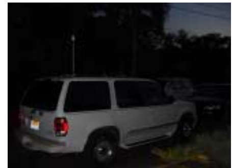
Preparation of the K5KG/VE7ZO mobile for the Florida QSO Party