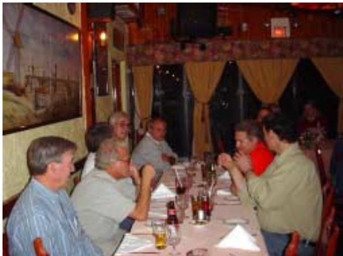
L-R W4OV, NP2B, NP2C, N8PR, K3VN, N2WB, K1TO, K4OJ