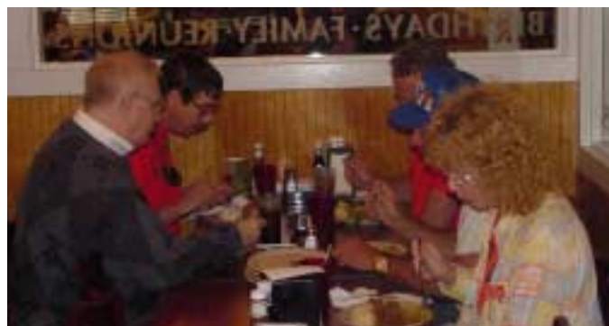
FCG members enjoying lunch at the Golden Corral Restaurant in Orlando before the FCG Meeting