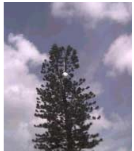
FCGer Bob N4BP installing a mast at the top of an 80 ft. pine tree in Bruce W4OV's front yard. A pulley has been installed at the top to hoist various loop antennas up and down. Watch out for Bruce in next season's 160 meter contests, where he's hoping that a loop antenna with this kind of apex elevation will be very effective.